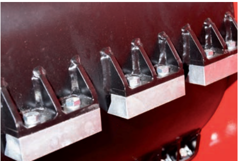
SCREWED CRUSHING LEDGES